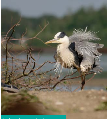
Hobby photography - heron